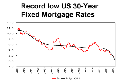
U.S. Housing booms unaffected by 2001 recession