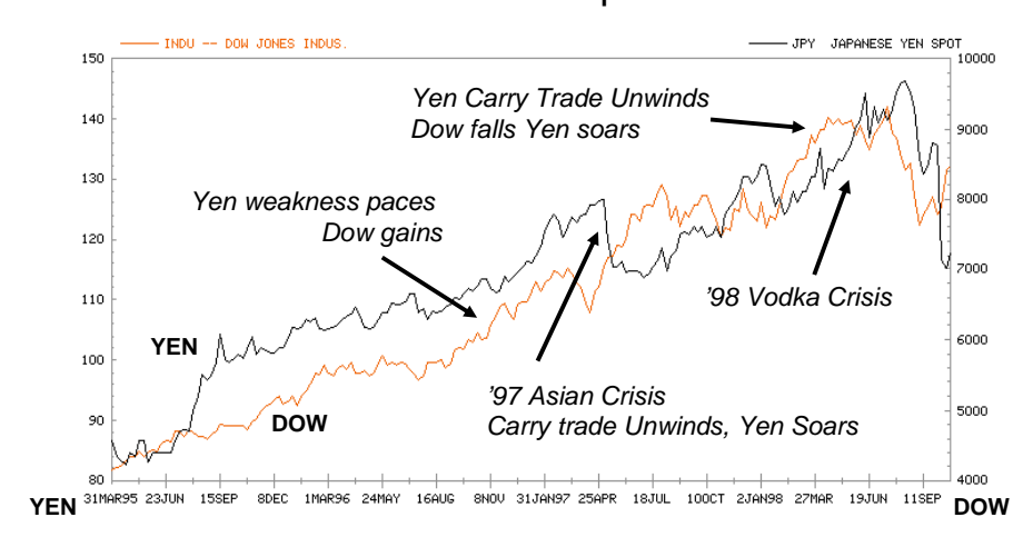
Chart#3 - Yen:Dow Carry Trade