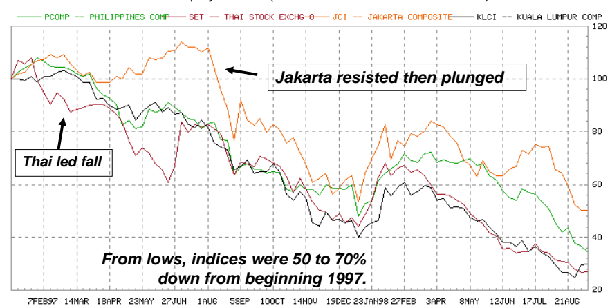
Chart #2 - Asean4 1997 Collapse

Jan97 – Aug97 Main Equity Indices (Normalized to 100 on 1 Jan 1997)