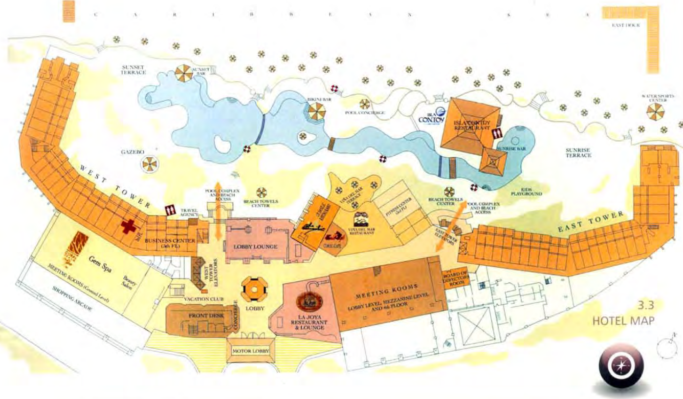
3.3 HOTEL MAP