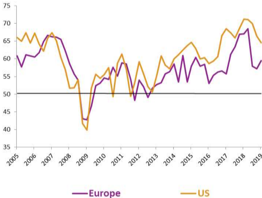
CFO survey: Optimism index

The survey's CFO Optimism Index has historically been an accurate predictor of future hiring and overall GDP growth.